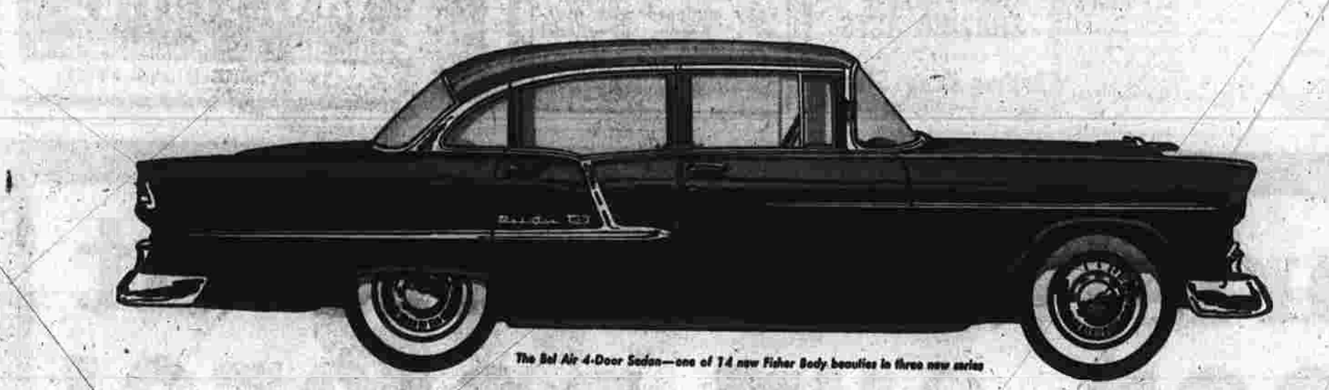
The Buick 4-Door Sedan—one of 14 new Fisher Body bodies in three new series